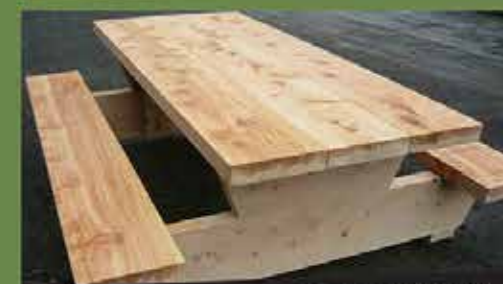
TABLES & BENCHSEATS