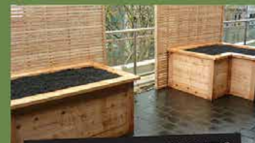
RAISED BED KITSETS

Macrocarpa Kitsets 0800 024 317 sales@macdirect.co.nz macdirect.co.nz