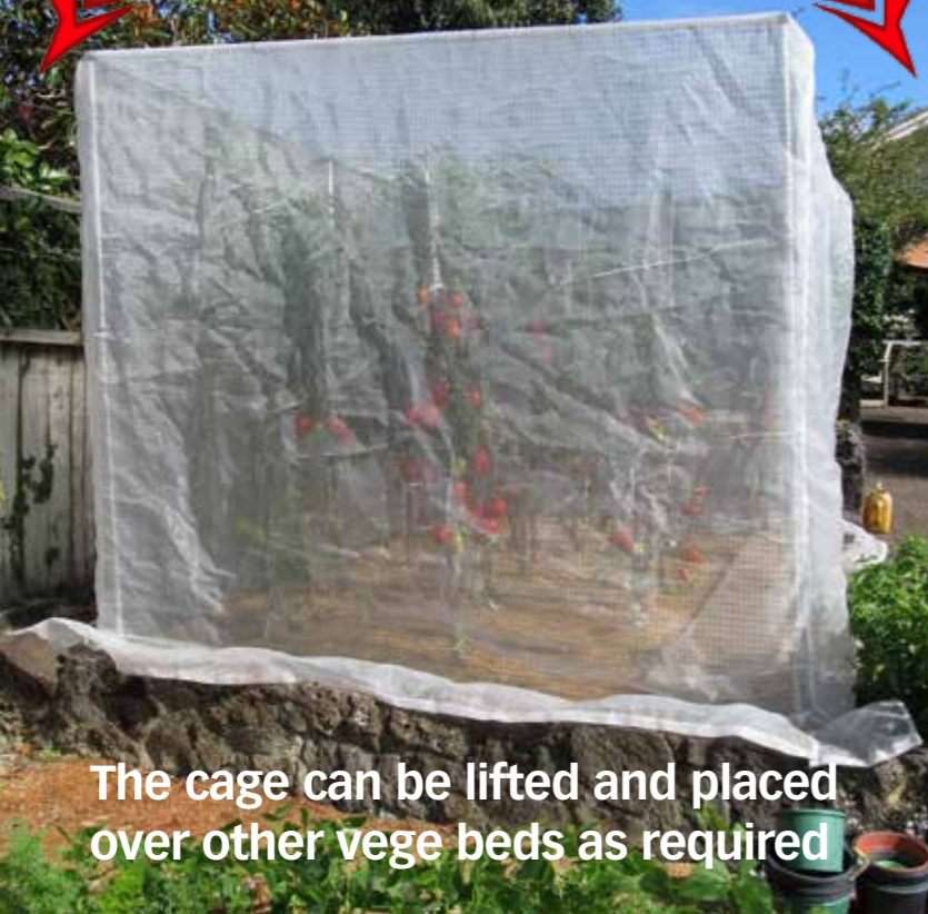
The cage can be lifted and placed over other vege beds as required