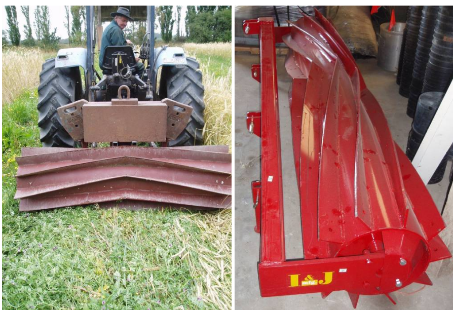
Figure 1. Helical blade roller crimper.

Termination method is an important factor as it needs to allow for planting machinery to plant through the mulch. An increasingly common technique for doing this are crimper rollers (Figure 1), which consist of a metal roller with vanes on it that bend and crimp the crop stem.