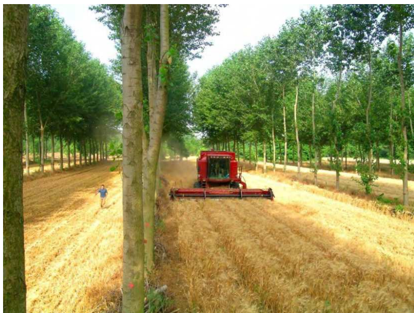
Figure 3. The INRA Vézénobres Agroforestry research site in France. From (Briggs, 2012).

Agroforestry is the planting of low density woody vegetation, typically trees, in pasture or cropping systems. Pasture agroforestry is called silvopasture, cropping is called silvoarable and with mixed farming agrosilvopastoral. Trees are typically planted in widely spaced rows, e.g., 20 to 60 m apart with densities of 50 to a few hundred trees a ha, with the pasture or crops grown in the 'alleyways' between the tree rows (Figure 3).