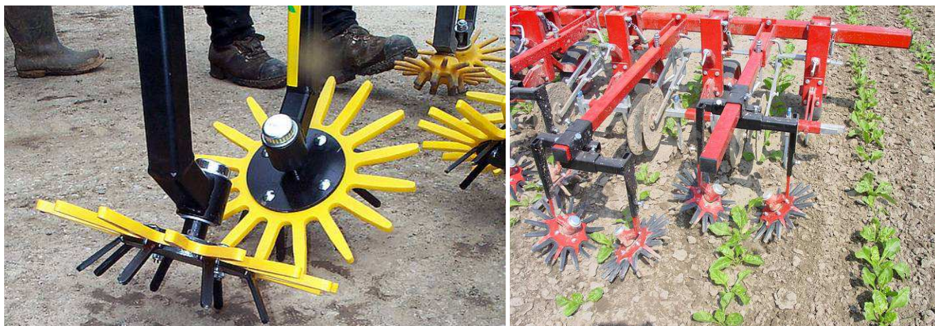
Figure 3. Finger weeders.