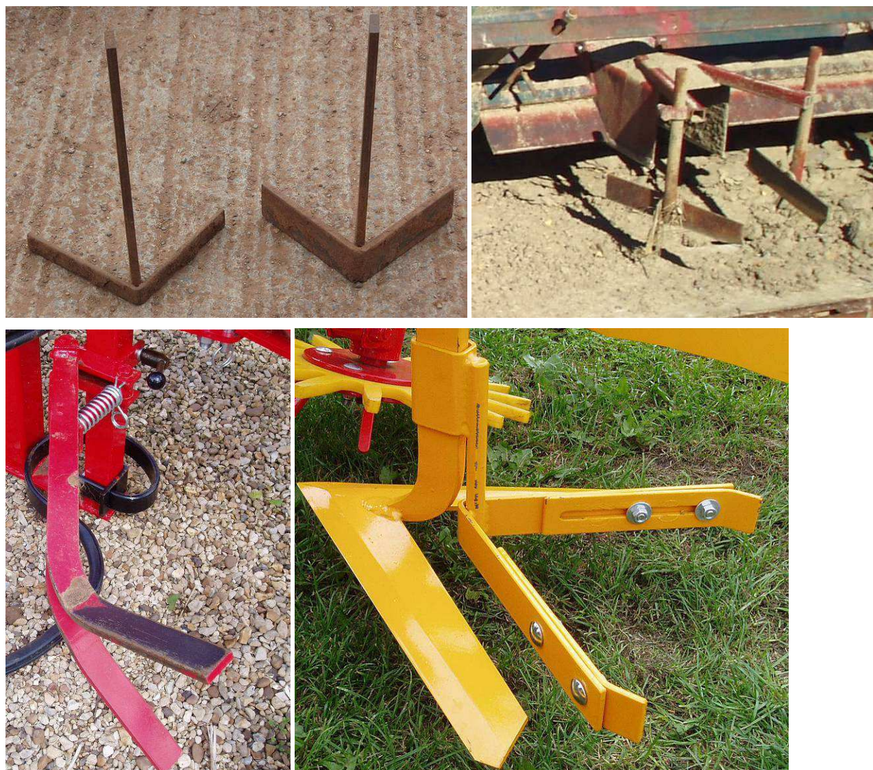
Figure 9. Various mini-ridger designs: Basic, vertical leg, V design, with two different ridger heights (top left), single blade, rotatable design on a rotary hoe / rotovator with wide crop gaps for field tomato production (top right), V design on a sloping sprung loaded leg (bottom left) and vertical leg V design with adjustable wings mounted behind a V blade hoe (bottom right).

It is therefore akin to potato ridging, but on a much, much smaller scale. The key to the system is getting the ridger design correct, which rather counterintuitively, the simplest design works best: it being just a flat metal bar with the long edge horizontal to the ground, angled at about 45° to the direction of travel / crop row, with the short edge set vertically (not tilted) and placed in the interrow, such that it funnels a small wave of soil into the intrarow (Figure 9).