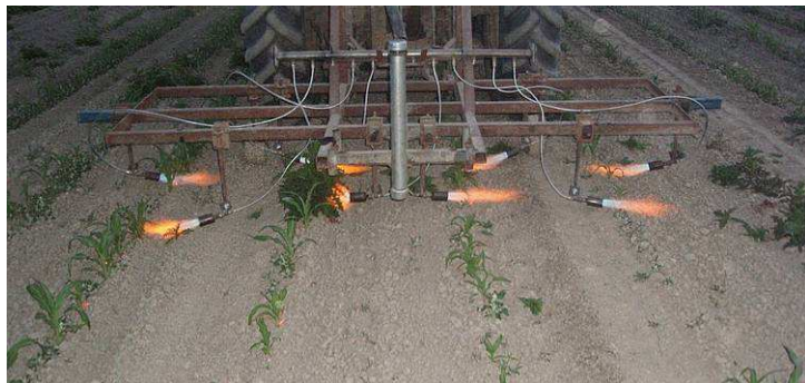
Figure 7. Non-discriminatory intrarow thermal weeder operating in sweetcorn.

their stem so it is well protected from heat, while some dicots have thick stems that can tolerate a moderate amount of heat, e.g., cabbages . This means that a thermal weeder is able to kill small weeds growing in the intrarow of such crops (Figure 7). This technique is the dominant thermal weeding technique in North America, but is less know outside that region.