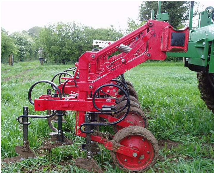
Figure 1. Standard design of modern interrow hoe using modular parallelogram toolframes (red) being steered by a computer vision guidance system (green).

These two technologies have revolutionised interrow hoeing from being a task only undertaken when there is absolutely no other alternative, to one that can fit alongside herbicides in the toolbox as an equally effective and even cheaper weed control option. Controlling interrow weeds without herbicides is now a straightforward and reliable task thanks to autosteer and modern interrow hoes. The action has therefore moved to the intrarow (within the crop row) and especially the 'close-to-crop-plant' weeds that exert the highest competitive effect against the crop (due to their proximity to individual crop plants). However, while GPS, computer vision and modular hoes have made interrow hoeing straightforward, intrarow weeding is a much tougher challenge.