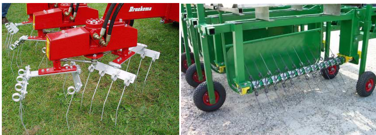
Figure 6. Vertical spring tine oscillating weeder (left) horizontal axis rotating spring tine weeder (right).

These machines kill weeds mainly by uprooting, severing and breaking, and a small amount via burial. The technique generally requires dry soil and weather, so the tines cause soil shattering thereby maximising uprooting and other weed damage, and weeds that are not directly killed by the weeding action are more likely to die if the weather is hot. While stones are very unlikely to damage these machines, they will reduce their effectiveness, especially when stones reach a size where they resist being moved by the tines. The machines also perform better in loose friable soil, and they lose effectiveness in hard-packed soil.