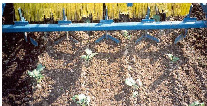
Figure 8. Mini-ridger in transplanted cabbages.

The technique works by creating a small, e.g. two to six centimetre ridge of soil within the intrarow, thus burying small weedlings but leaving the larger crop plants above the soil mound (Figure 8).