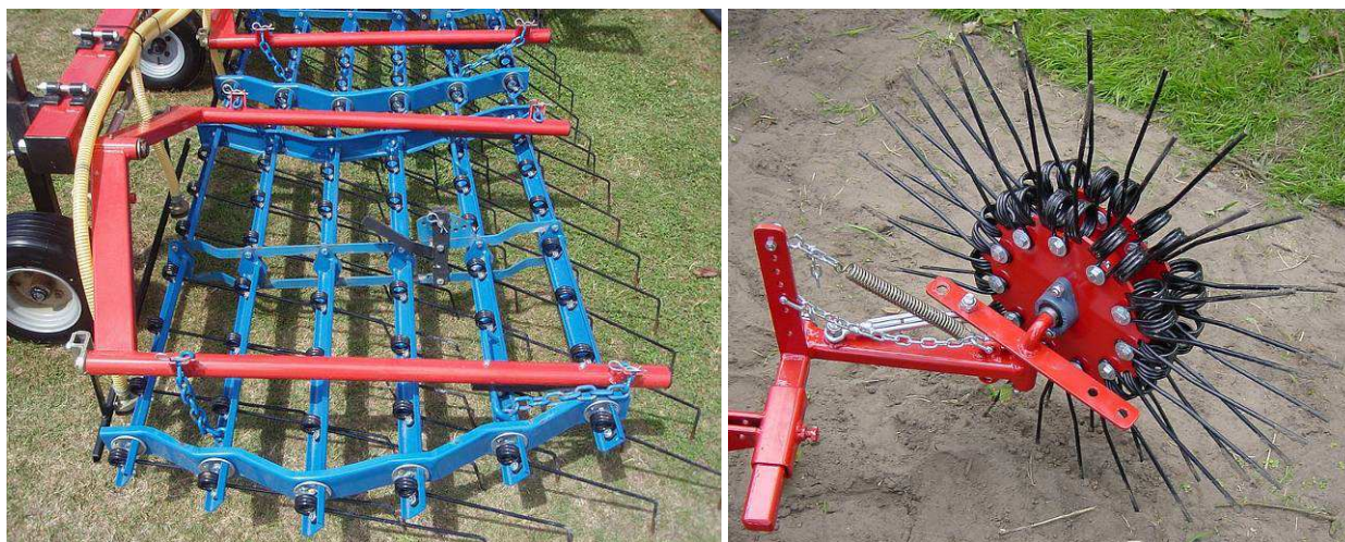
Figure 5. Spring tine harrow (left) rotary spring tine weeder (right).

Successful intrarow weeding with vertical spring tines therefore mostly requires dedicated equipment. This includes designs such as the rotary spring tine weeder (Figure 5), the vertical spring tine oscillating weeder (Figure 6) horizontal axis rotating spring tine weeder (Figure 6) plus many more designs on this general theme of vertical spring tines. These machines are best suited to thin upright crops such as maize/sweetcorn, leeks, and cereals, while they can cause significant damage to leafy spreading crops, e.g. lettuce, spinach.