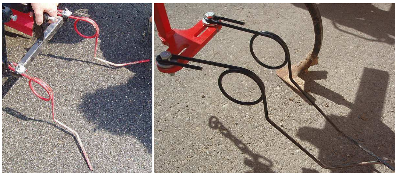
Figure 4. Torsion weeders

Torsion weeders (Figure 4) also work by breaking up the soil in the intrarow, but with more of a shattering effect than the mixing / churning effect of finger weeders. Also like finger weeders they are most effective against cotyledon stage weeds, and rapidly lose their efficacy as weeds grow beyond two true leaves. They also require loose level soil and only work in dry soil as the shattering effect does not work when soil is plastic. They are also unable to penetrate hard soil or be effective where there are stones. While they can be quite effective, they require precise setup, as only small differences in both vertical and horizontal placement can result in very large variation in the aggressiveness, from no effect at all to killing the crop. Very good depth control and steering are therefore required. In compensation, the tools are very simple - just shaped spring steel rod, so are cheaper than finger weeders (though more expensive parallelogram depth control systems are required). The summation of this means that maximum weed mortality is around 75% and it is often much lower.