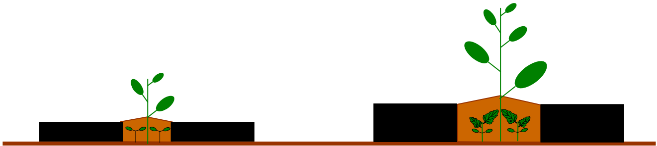
Figure 10. Diagram of how the height of the mini-ridger affects ridge height.

Larger ridge for more mature crop and bigger weeds